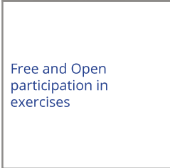
Free and Open participation in exercises