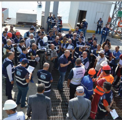
Free and Open participation in workshops