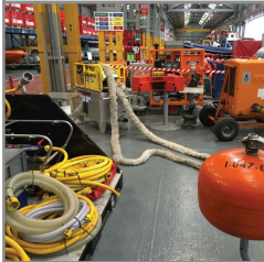
Sharing Resources and Equipment