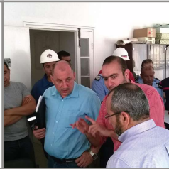
Sharing experiences and expertise