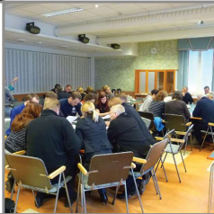
Training IMO levels 1-2 and 3 and ICS 100-200-300 and 400