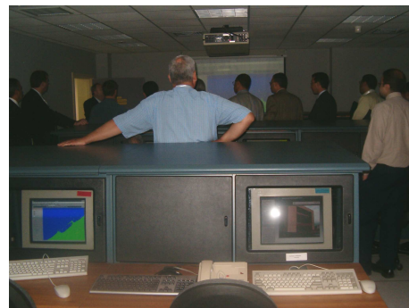
Presentation of the simulator of the Arab Academy

The MOIG delegates, as evaluators and observers of the Exercise, were responsible for observing player actions and evaluating the execution of Response Plans and accessing the effectiveness of the response.