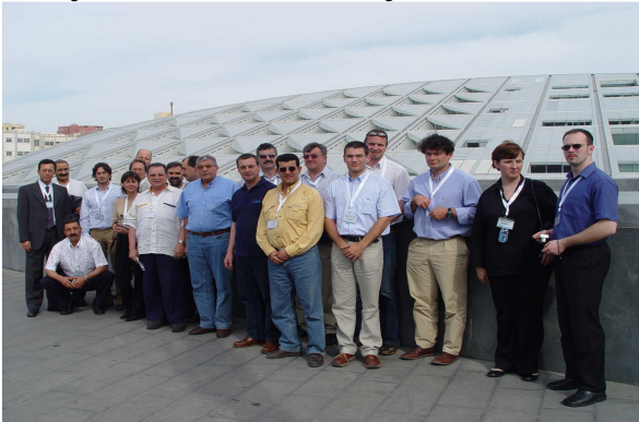
Photo of the MOIG Delegates