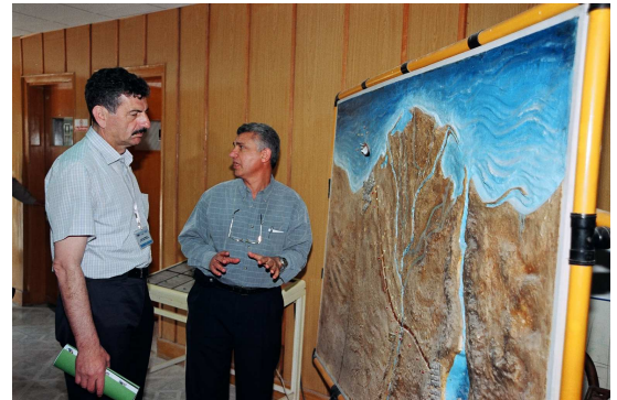
Briefing session on the RA ATUM Exercise