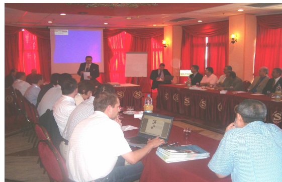
MOIG Technical session

At 1800 hrs, we started with a technical presentations session in the meeting room of the Sheraton Hotel. All MOIG delegates and representatives of a majority of the Egyptian Oil and Gas Companies participated in this meeting.