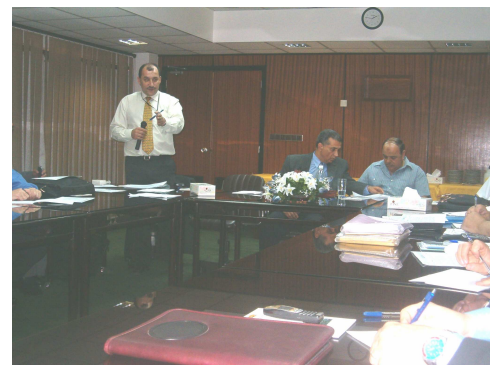
Last meeting of the Steering Committee at SUMED Office in Alexandria