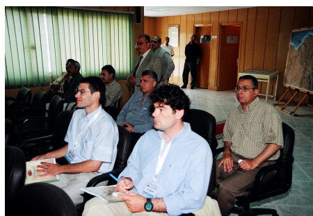
Presentation of SUMED and Sidi Kerir Terminal to MOIG Delegates