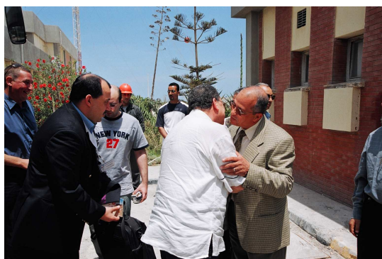
Arrival of MOIG Delegates at Sidi Kerir Terminal

The first presentation was delivered by SUMED Terminal General Manager on the Terminal's activities and developments since inception.