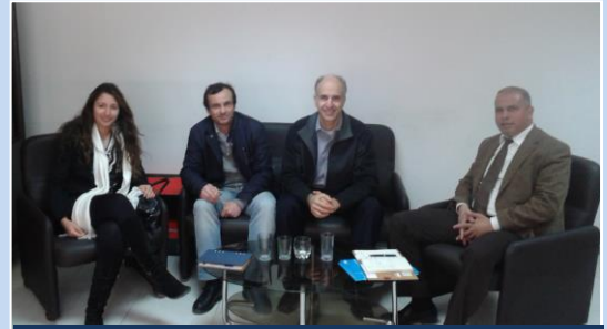
Meeting MOIG Director-SAROST Representatives

April 06- A meeting took place in MOIG office with SAROST representatives, in which it was discussed the possibility to develop relationships and collaboration as well as new projects in order to promote shared interests. SAROST is a Tunisian company providing specialized and integrated services in the field of water, energy and environment for the offshore Oil and Gas Exploration and Production.