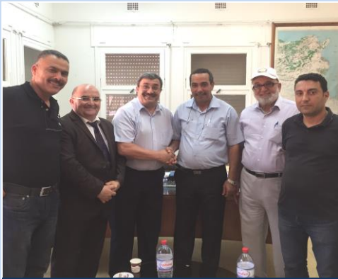
Agreement between ETAP and TRAPSA for the Coordination Center location in Skhira Terminal

May 28- Given the recent international media attention to oil spill disasters it is clear that the public's perception of a risk of an oil spill from the offshore oil and gas industry is ramping up globally, whilst at the same time there are calls for the industry to do more.