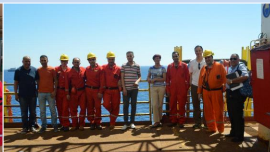
Group photo: Observers with Management Exercise