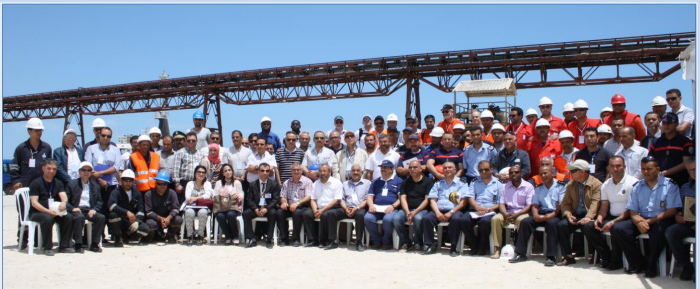
Exercise Day: Group Photo

The spill response teams deployed equipment in two formations according to environmental data (Wind, current, tide, visibility etc.) within the Zarzis Terminal. In addition the Civil Protection Society provided firefighting units, ambulances, support vessels and rapid intervention water craft.