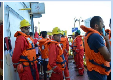
Evacuation: PFC Muster point

The exercise lasted 60 minutes and comprised a Management Exercise at the PFC Control Room, Ifrikia II Control Room and Sfax Base Crisis Room.