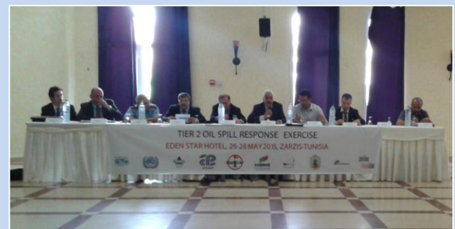
Opening Day at Eden Star Hotel, Zarzis-Tunisia

The exercise comprised a management exercise at MARETAP Port Operations Control Centre and a full scale oil spill response equipment deployment. Over 143 personnel from various companies and agencies participated in the table top and Terminal exercise.