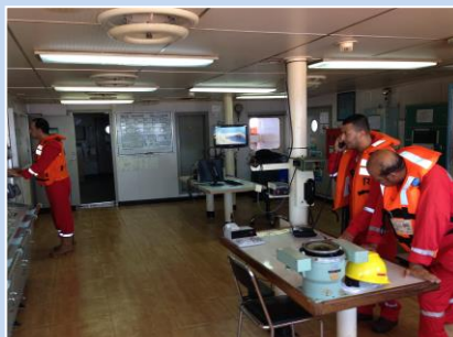
Notification in Ifrikia II control room