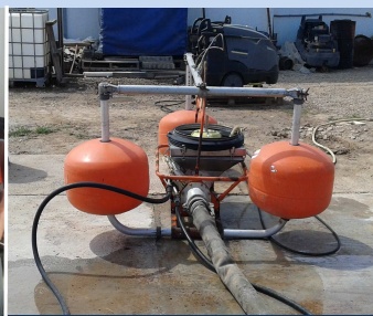
MARETAP Equipment Check