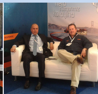
Visit of MEKE Stand