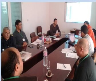
Ezzaouia CPF Meeting

We are looking forward to your active participation to this important event.