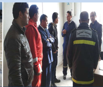
OMMP Meeting-Control Room