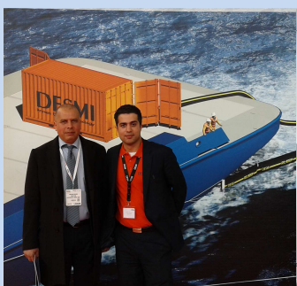
Visit of DESMI Stand

The event was a great success and good opportunity to promote MOIG as well as to meet the attending members, technical partners, organizations, services companies such as: DESMI, SWIRE-IEMS, NRC, SHELL, MEKE, , REMPEC, OSRL, CEDRE, FOST, NOFO, FRAMO, NORLENSE, ARAMCO, ISCO, EMSA, UK SPILL, OSCT, RPS ASA, SIGMA, WITT/O'BRIENT'S etc.... that led to a fruitful discussions with key persons and experts paving the way to develop relationships that allow for exchanging information and experiences and sharing best practices on oil spill prevention, preparedness and response.