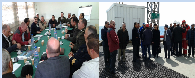
TRAPSA Terminal Meeting, 09 March 2015

MOIG was taking part in a high level meeting attended by relevant stakeholders at Skhira terminal on the 09 th March 2015, TRAPSA management demonstrated the high quality of terminal management pursued and how the terminal maintains constant focus on environmental protection.