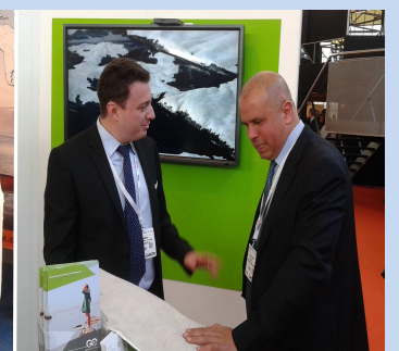
Visit of GREENOCEAN Stand