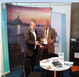
Visit of SWIRE-IEMS Stand