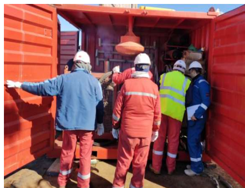
Check of OSR equipments - 26.01.2023

A check of OSR equipments and a pre-exercise were respectively held on 26 January and 14 September 2023 in Cercina field.