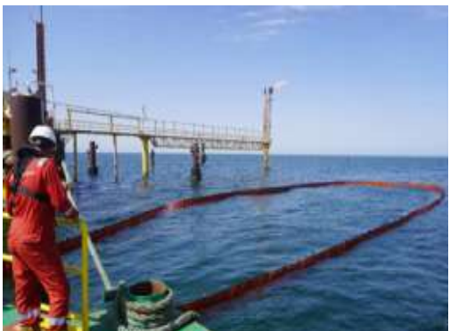
Containment of the oil spill - 21.09.2023