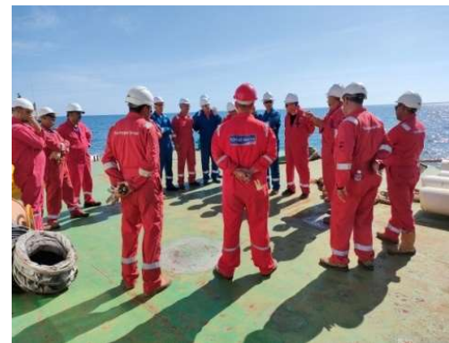
Pre-Exercise - Briefing - 14.09.2023