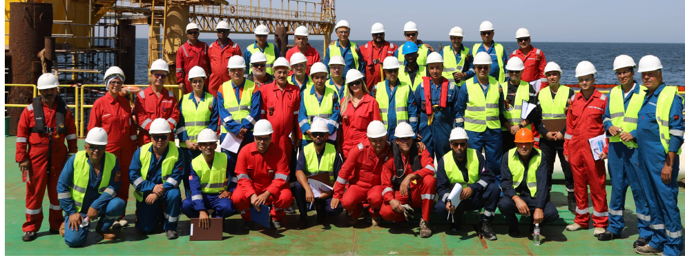
Group photo - Barge - 21.09.2023