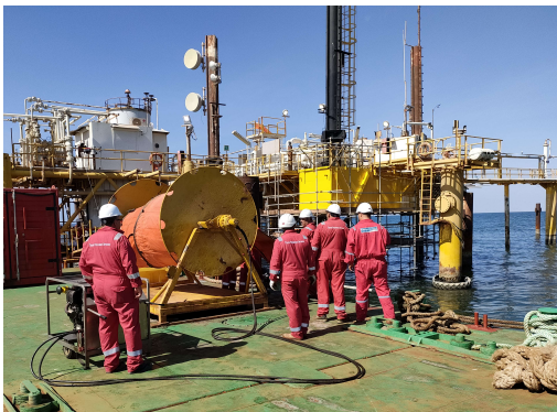
Fence boom deployment - 21.09.2023

The MOIG Management Committee Members would like to thank TPS representatives for their warm welcome, hospitality and high level of cooperation shown during the development of the exercise.