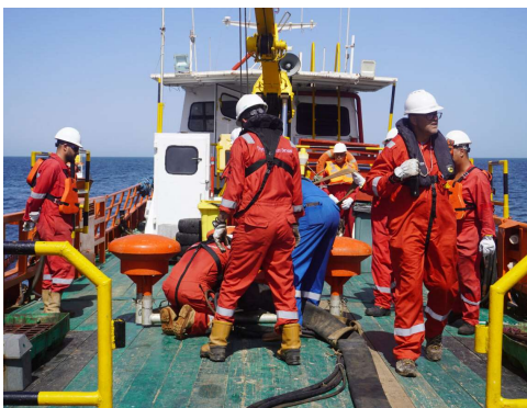
Skimmer deployment - 21.09.2023