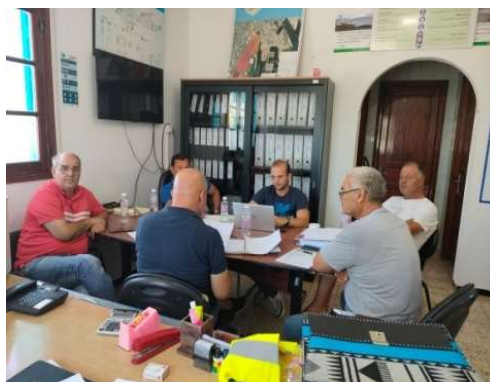
ESC Meeting N°7- 13.09.2023