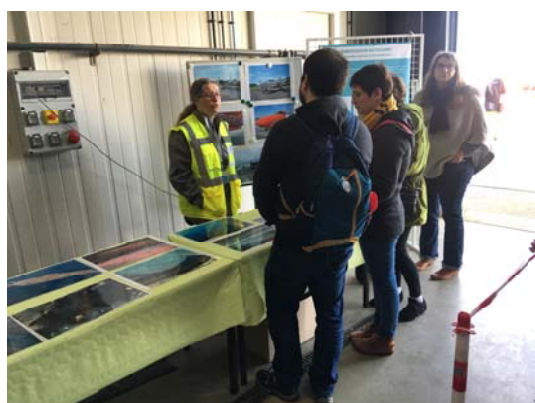
Station A: Identification of Pollutant

The MOIG Management Committee would like to thank Cedre for their kind invitation and warm welcome during this visit.