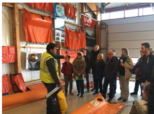
Station B: Response in Water