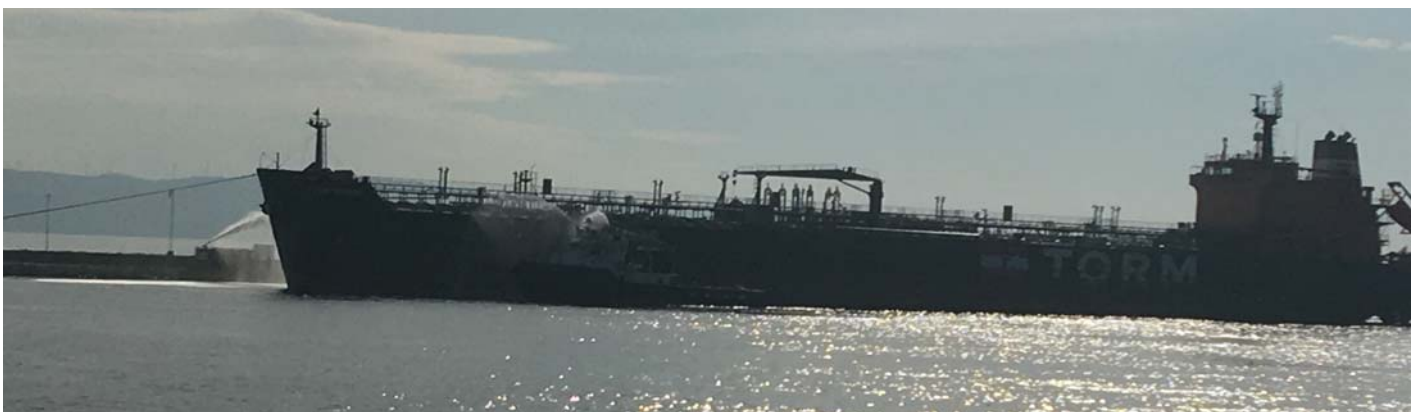
STIR Jetty: Fire fighting operations of the Oil Tanker

28 February 2018, MOIG was invited as evaluator by OMMP-Bizerte and STIR to UTIQUE Exercise performed in Bizerte city in Tunisia under the auspices of Tunisian Ministry of Transport. The exercise was organized jointly by OMMP-Bizerte and STIR assisted by the Civil Protection (ONPC), Security Forces from the Ministries of National Defence and Interior.