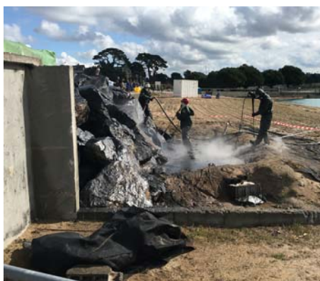
Station C: Cleanup Live Demonstration