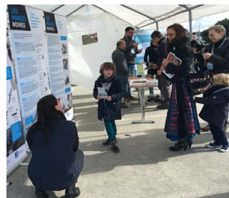
Station D: Post-Pollution