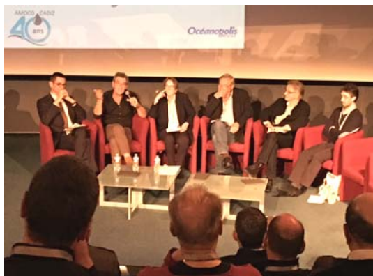
Panel 3: Ecological Impacts of Marine Pollution