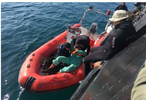
Joumine Tug: Evacuation of Injured