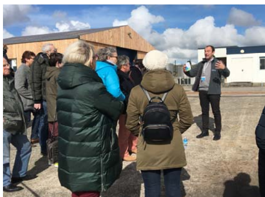
Station C: Shoreline Cleanup