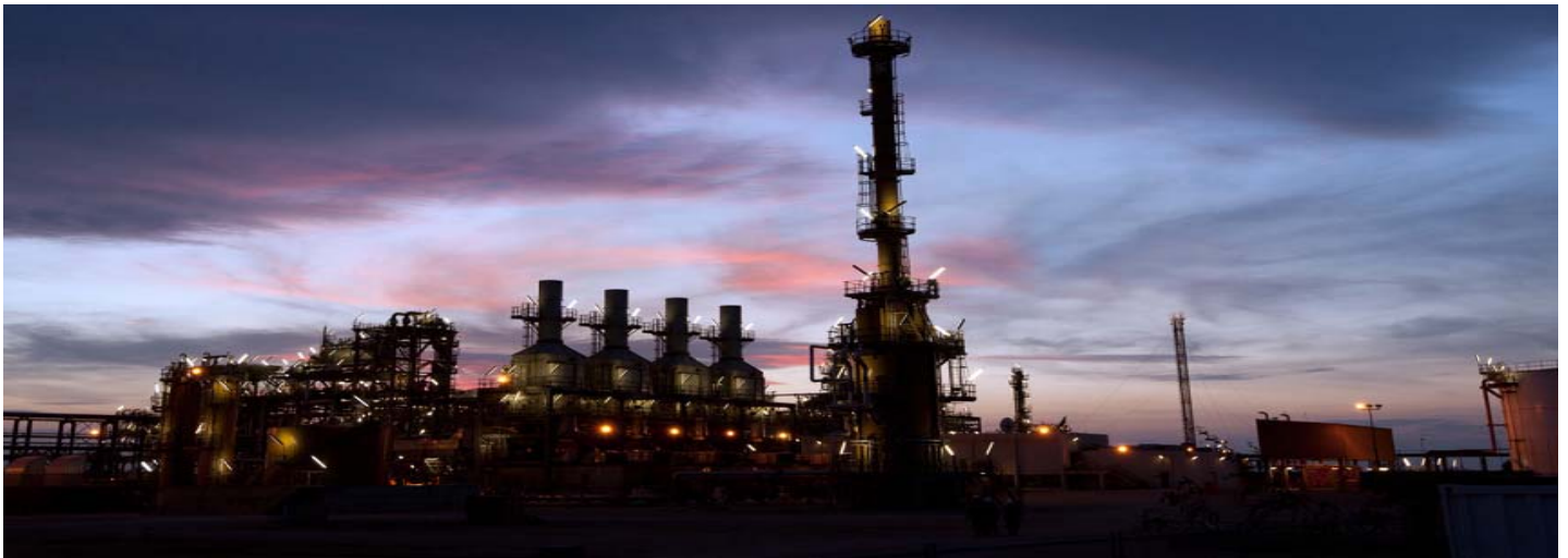
Onshore Hasdrubal Plant - Sfax

03 January 2018, The MOIG Management Committee members are very delighted to welcome the new member Amilcar Petroleum Operations (APO). APO is a 50/50 Joint Venture Company between ETAP (Tunisian National Oil Company) and Shell Tunisia Upstream (STU) created on 06 May 2014 as the Operator of Hasdrubal field.