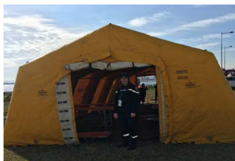
Marina : ONPC Adcanced Post