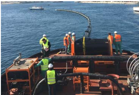
Joumine Tug: Boom Deployment