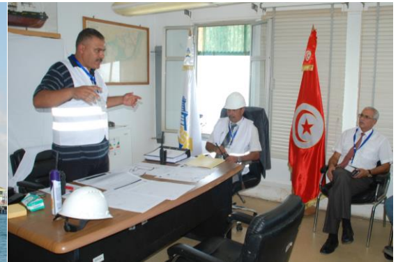
TRAPSA Emergency Operations Center

The water exercise comprised a full scale oil spill response equipments deployment (400 meters fence boom, skimmer and Floatable Storage Tank) and Mobilization of TRAPSA Marine assets( Shkira Pilotine, Khenaiés 1,2,3 boats and Douleb and Mereksen Tugs) provided by 02 response teams onshore and off Shore to contain and recover the oil spilled product.