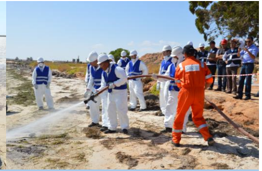
High Pressure Cleanup

About 60 delegates from Tunisia and the Mediterranean region positioned in the Emergency Operations Center in TRAPSA Harbor Muster, in the jetty, in Shkira Pilotine, in Douleb tug and in the shoreline observed in real time the first hands and action-packed oil spill exercise, Emergency Evacuation drill and shoreline cleanup Exercise.