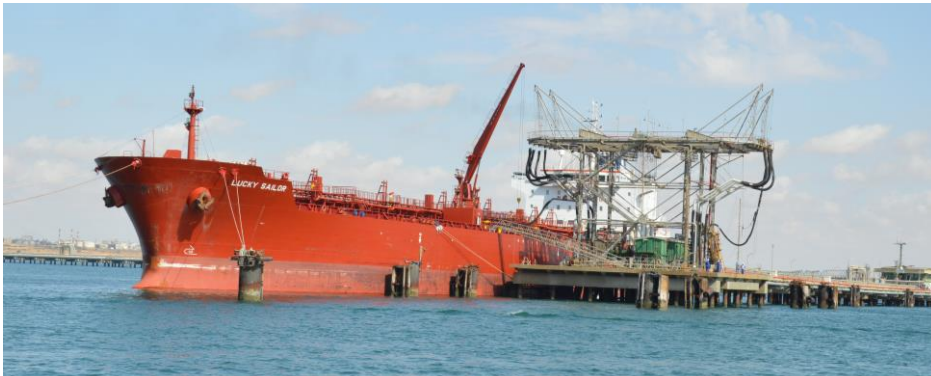
Oil Tanker "Lucky Sailor" accosted on the Jetty-TRAPSA Terminal

The second day was dedicated to deployment of Oil Spill Response equipments in water and Shoreline Cleanup. The exercise scenario was selected from TRAPSA Oil Spill Contingency Plan and consists in the simulation of an oil spill due to flexible blowout during the loading operations of one oil tanker accosted in the Post N°1 in the jetty. The quantity of the spill was estimated between 15 to 20 m 3 , some of which reached the shoreline and sensitive areas due to currents and winds leading the activation on TRAPSA Oil Spill Contingency Plan.