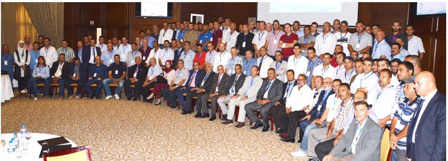
Workshop Group Photo