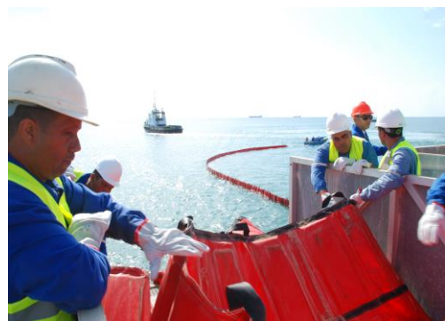
Fence Boom Deployment

The water exercise comprised a full scale oil spill response equipments deployment (400 meters fence boom, skimmer and Floatable Storage Tank) and Mobilization of TRAPSA Marine assets( Shkira Pilotine, Khenaiés 1,2,3 boats and Douleb and Mereksen Tugs) provided by 02 response teams onshore and off Shore to contain and recover the oil spilled product.