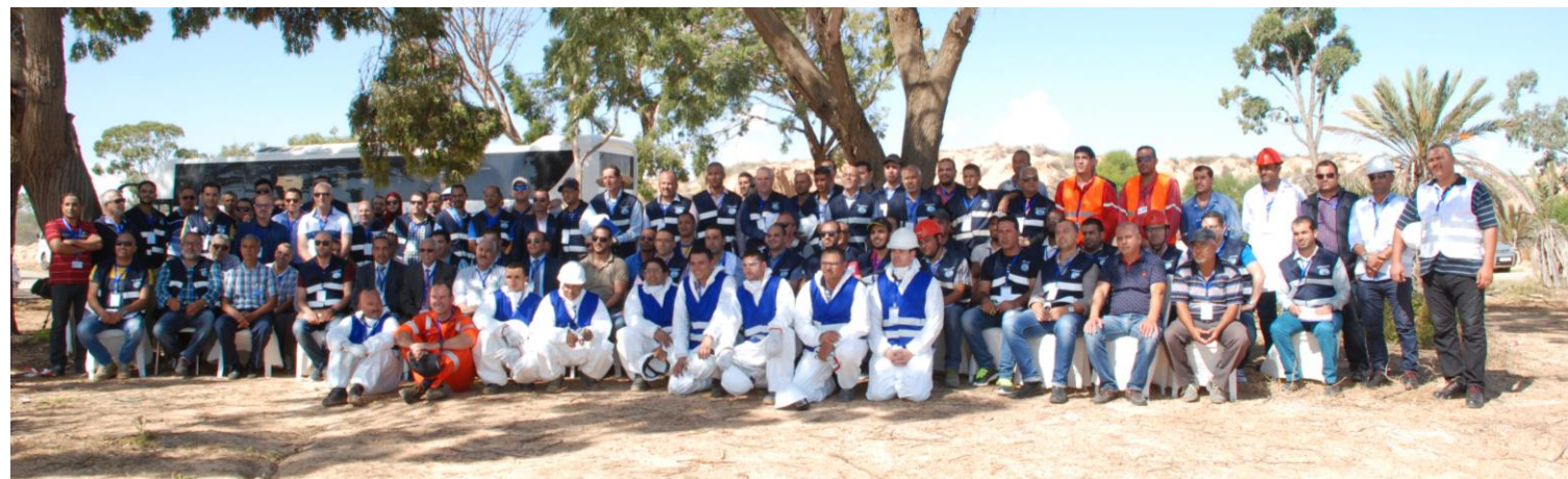
Group Photo: Observers with Shoreline Cleanup Response Team

Debriefing was held in TRAPSA Terminal immediately following the shoreline cleanup exercise. The general feedback was highly positive and the participants are to be congratulated for their efforts and professionalism during all exercises stages. The overall average score was 7.92/10. According to the methodology and scoring principals, this score indicates that most objectives were achieved however there is room for some improvements.