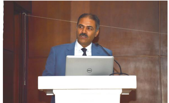
Workshop Opening by Sfax Governor