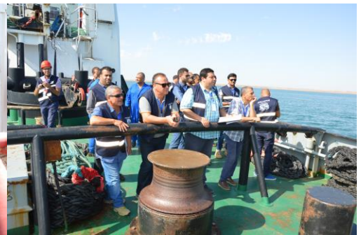
Observers on Douleb Tug

Debriefing was held in TRAPSA Terminal immediately following the shoreline cleanup exercise. The general feedback was highly positive and the participants are to be congratulated for their efforts and professionalism during all exercises stages. The overall average score was 7.92/10. According to the methodology and scoring principals, this score indicates that most objectives were achieved however there is room for some improvements.