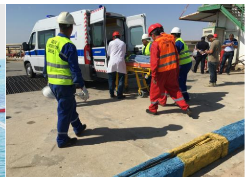
Emergency Evacuation Drill

At the same time, an emergency evacuation drill was performed by HSE and Medical teams of one injured person from the onshore response team slipped on the jetty during the recovery of fence boom. All the actions were controlled by the exercise incident management team who were located in the Emergency Operations Center at TRAPSA Harbor Muster.