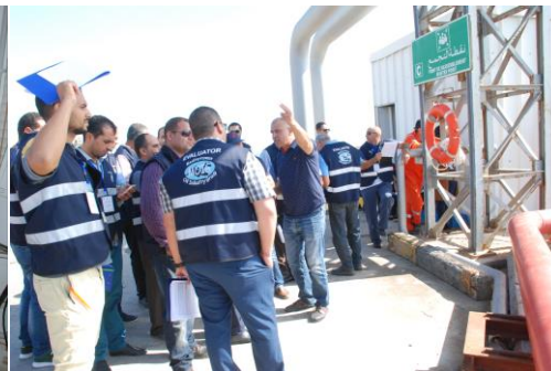
Observers on the Jetty