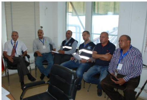
Observers in the EOC

About 60 delegates from Tunisia and the Mediterranean region positioned in the Emergency Operations Center in TRAPSA Harbor Muster, in the jetty, in Shkira Pilotine, in Douleb tug and in the shoreline observed in real time the first hands and action-packed oil spill exercise, Emergency Evacuation drill and shoreline cleanup Exercise.