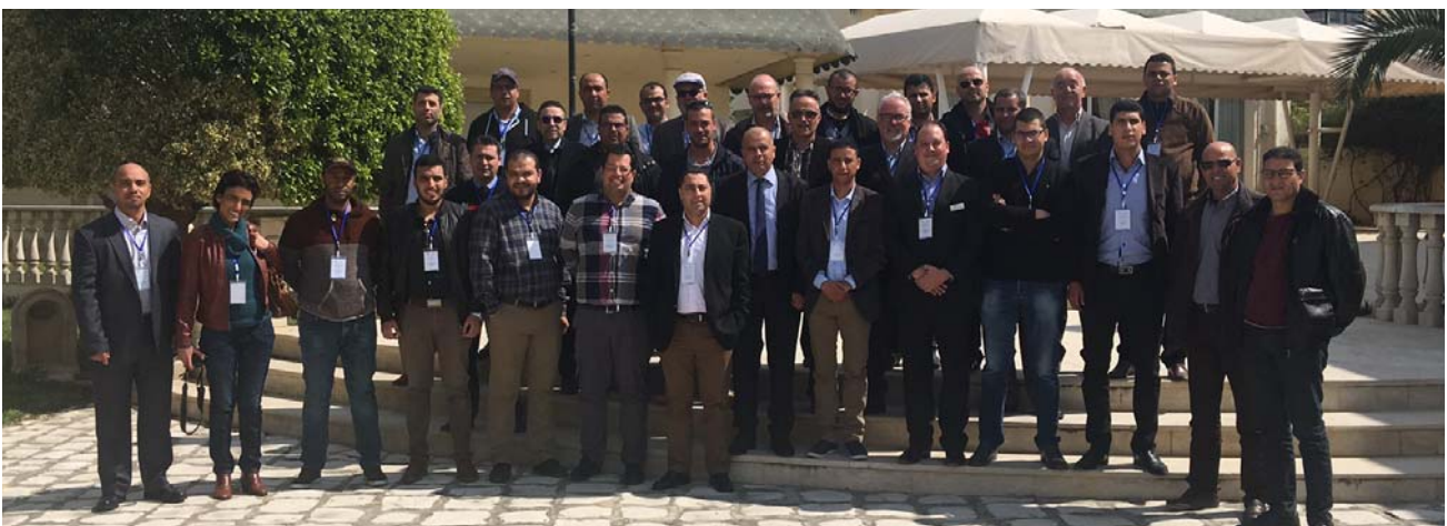
Group photo: Participants of Day 2-15 March 2017