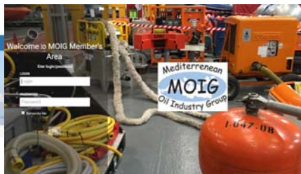
MOIG Website : Members Area

The new website allows members direct interaction with MOIG secretariat and access to key activities, newsletters, oil spill response resources data, drills and exercises, workshops and training, membership, library and links on social networks etc.... MOIG is currently developing a new application named Members Area that will allow members to share their oil