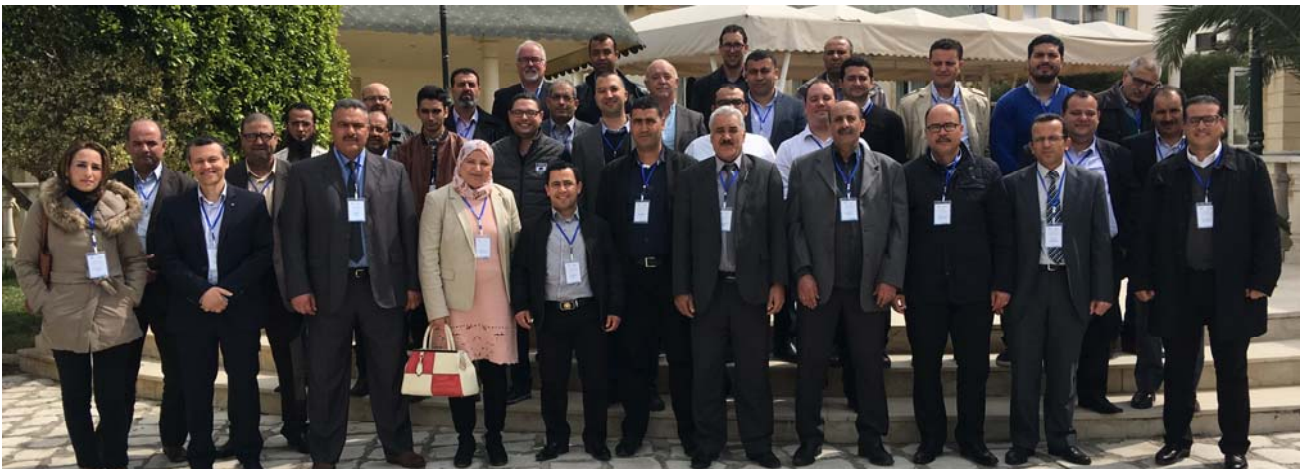
Group photo: Participants of Day 1-14 March 2017