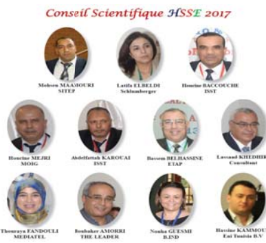
HSSE 2017 Steering Committee Members