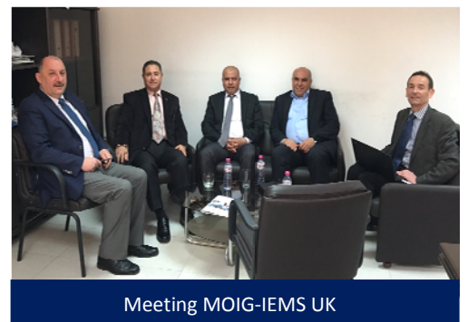
Meeting MOIG-IEMS UK

During the visit MOIG was able to further promote the forthcoming Regional Workshop and Skhira Oil Spill Response Exercise scheduled to be held in Sfax city and TRAPSA Terminal in the first half of October 2017.