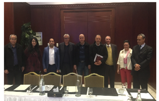
3 rd ESC Meeting-10 March 2017

Safety, Security, Environment and Corporate Social Responsibility. The MOIG Director was designated by the HSSE 2017 Steering Committee to chair and animate the plenary session N°9 related to Testimony and Exchange of Good Practices in Health, Safety, Security and Environment. The MOIG Management Committee Members would like to thank the HSSE 2017 Steering Committee for its confidence in MOIG.