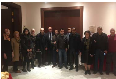
2 nd ESC Meeting-06 January 2017

06 January - 10 March 2017, the MOIG Director was invited to the second and third Steering Committee Meetings held in the Grand Hotel in Tunis-Tunisia to discuss the final version of the programme of Health, Safety, Security and Environment Conference HSSE 2017 scheduled to be held from 24 to 26 April 2016 in Ramada Plaza Hotel-Gammarth in Tunis-Tunisia. MOIG presented its extensive experience in organizing major events. More than 150 participants from the active Oil and Gas Industry in Tunisia, National Agency of Environment Protection, Work Safety and Health Institute, Engineering Firms, Services Providers, National and International consultants, experts, academics are expected to participate to this conference to discuss many topics related to Health