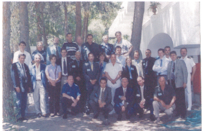
MOIG Members, Loutraki, Greece, June 2001

The last MOIG meeting took place in Loutraki, Greece from 5-8 th June 2001, hosted by Motor Oil (Hellas). Various members gave presentations covering topics such as the oil spill response arrangements in Greece, Morocco and Spain. The MOIG Constitution and Rules were discussed as well as the membership fees, which started in 2001.