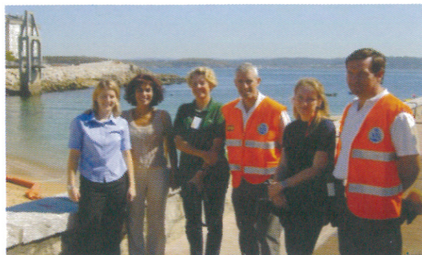
Oil Spill Exercise, La Coruna. Representatives from Spain, SASEMAR, CEDRE, ITOFF & IPIECA