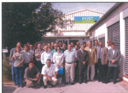
MEDIPOL 2003 delegates

The Workshop-MEDIPOL 2003 was particularly intended for operational staff from authorities in charge of pollution control who have been designated to play a role related to surveillance and monitoring activities (detection of illicit oil discharges at sea), gathering of evidence and prosecution of offenders.