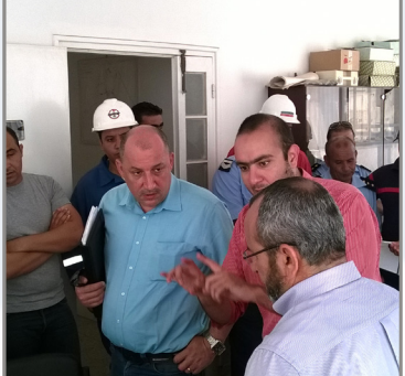
Sharing experiences and expertise

Free and Open participation in exercises