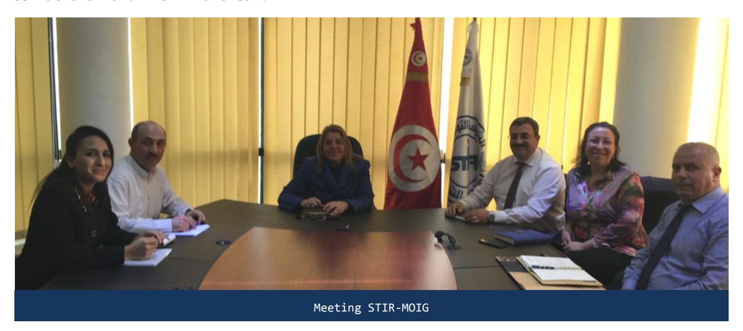
March 29, A first meeting took place in STIR Refinery in Bizerte between STIR-OMMP and MOIG-OSRA representatives to exchange the first ideas and views about the exercise. April 05, A second meeting was performed in STIR Headquarter in Tunis between the Chairman and HSE team of STIR and MOIG representatives to discuss the preliminary programme of the exercise. We are very pleased with the outcome of these meetings, the STIR General Management, MOIG, OMMP and OSRA Int. representatives expressed a range of views regarding the programme and technical and logistical arrangements and agreed to mobilize adequate human and material resources to ensure the success of this event.

STIR social purpose is the refining of crude oil in order to satisfy the needs of the national market in terms of oil products. The company has a huge Tank Park of 01 Million Cubic Meters capacity. STIR is enhancing its strategy of preparedness in case of oil spill incidents and shall request assistance of OMMP and ONPC during the development stages of the exercise. The theoretical part will take place in Resort Hotel in Bizerte City on 25 May 2016 in which will be presented the involved companies in the exercise and awareness on oil spill preparedness and response and new combating technology animated by AOST/OSRA International and DESMI Ro-Clean.