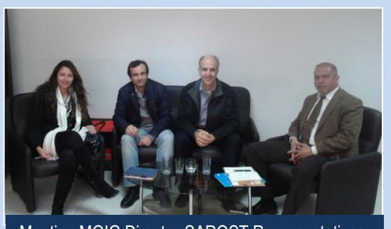
Meeting MOIG Director-SAROST Representatives

April 06 - A meeting took place in MOIG office with SAROST representatives, in which it was discussed the possibility to develop relationships and collaboration as well as new projects in order to promote shared interests. SAROST is a Tunisian company providing specialized and integrated services in the field of water, energy and environment for the offshore Oil and Gas Exploration and Production.