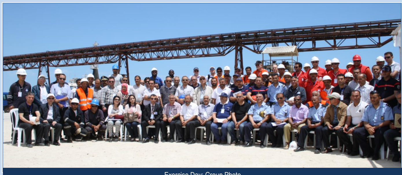
Exercise Day: Group Photo

The spill response teams deployed equipment in two formations according to environmental data (Wind, current, tide, visibility etc.) within the Zarzis Terminal. In addition the Civil Protection Society provided firefighting units, ambulances, support vessels and rapid intervention water craft.