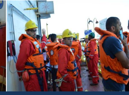
Evacuation: PFC Muster point

The exercise lasted 60 minutes and comprised a Management Exercise at the PFC Control Room, Ifrikia II Control Room and Sfax Base Crisis Room.