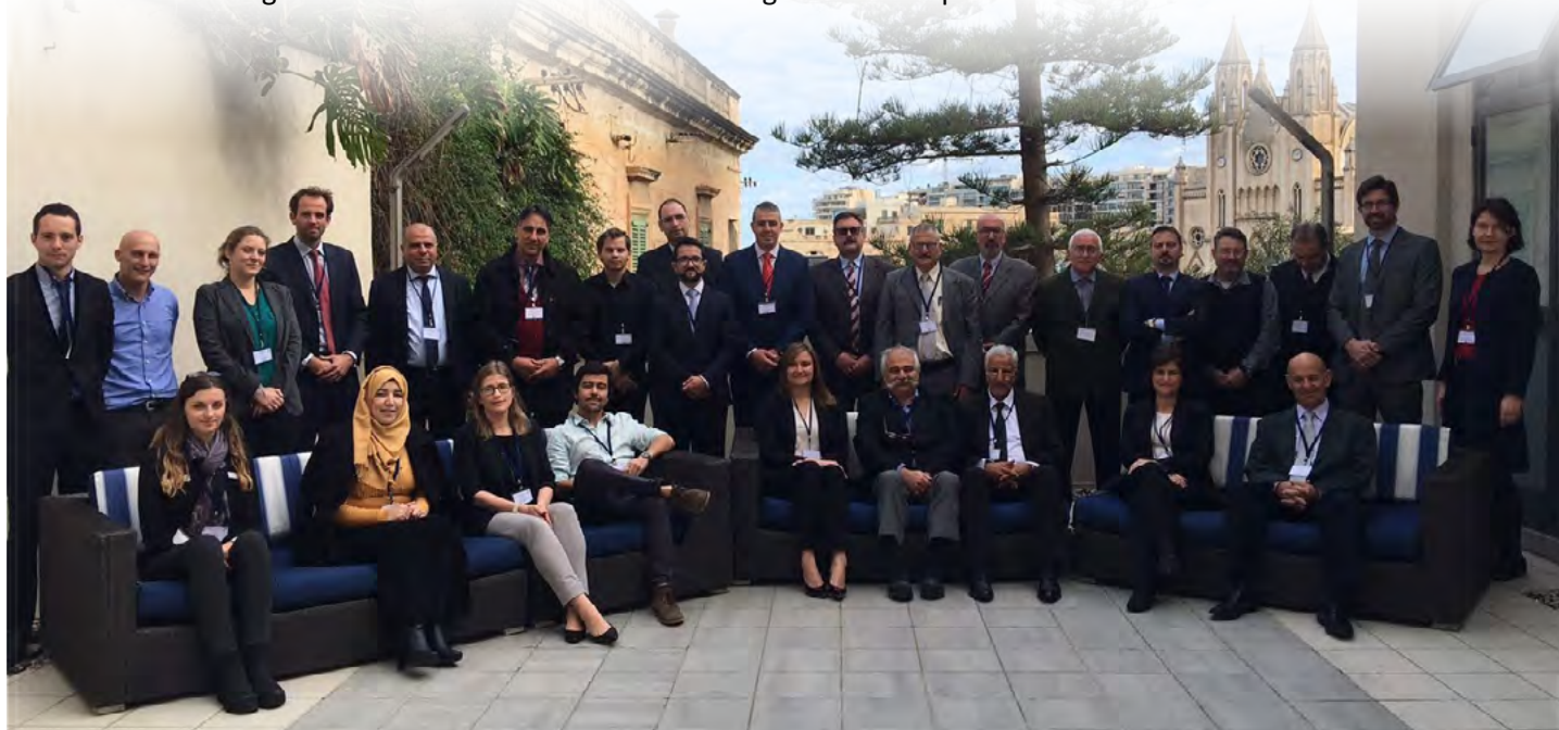
Group Photo of Workshop Participants

December 14-15, the MOIG Director was invited by REMPEC to attend the Regional Workshop on Cooperation Arrangements in the Field of Preparedness for and Response to Oil and Hazardous and Noxious Substances (HNS) Spills-MEDEXPOL 2016 held over 14-15 December 2016 at the Meridien St Julians Hotel in Malta. The main objectives of this event were to review and examine the proposed draft guide on Cooperation Mutual Assistance in responding to Marine Pollution Incidents and give clear instructions and guidance to REMPEC Secretariat for its finalization, prior to its transmission for review and adoption to the twelfth meeting of REMPEC Focal Points which will be held from 23 to 25 in May 2017 in Malta. The event gathered 29 participants representing the contracting parties to the Barcelona convention and its protocols and Associations and Organizations from the Mediterranean region and Europe.