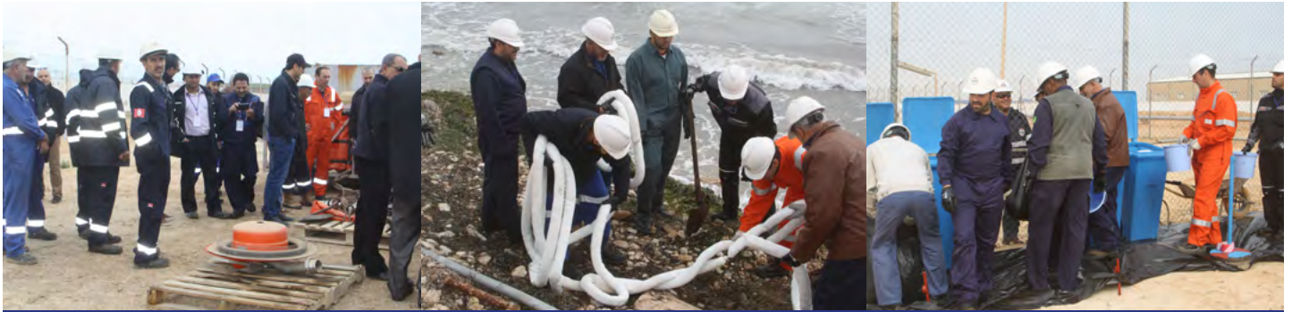
OSR Equipment Demonstration

November 24, as announced, a practical exercise “Oiled Shoreline Survey and Cleanup” was held in Zarzis City located on the coast of the Mediterranean Sea in South-Eastern Tunisia. The event was organized jointly by Cedre, REMPEC, ISPRA, FEPORTS, MOIG, MARETAP and ECUMED. The exercise is a part of the project for Preparedness for Oil-polluted Shoreline Cleanup and Oiled Wildlife interventions (POSOW II) co-funded by the European Union under the Union Civil Protection Mechanism. The main objectives of this event are to improve the Preparedness and Response to marine pollution in the Mediterranean Region and develop training for representatives of Libyan Oil and Gas Industry.