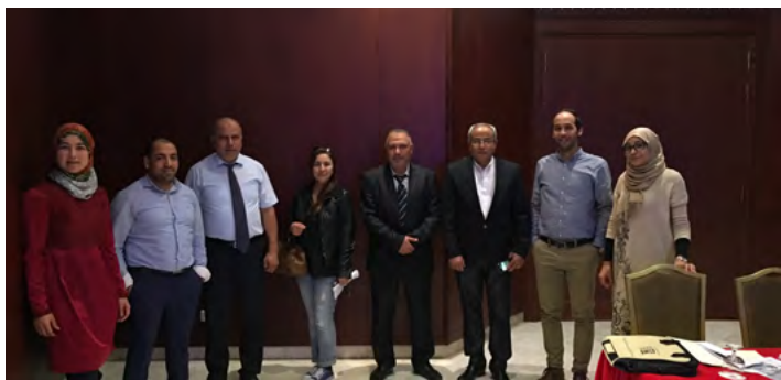
Group Photo of Meeting Participants

November 04, The MOIG Director was invited to the first scientific committee meeting held in the Grand Hotel in Tunis-Tunisia to discuss the preliminary programme of Health Safety and Environment Conference HSE 2017 scheduled to be held from 24 to 26 April 2016 in Ramada Plaza Hotel-Gammarth in Tunis-Tunisia. The meeting gathered experts from the Oil and Gas Industry, Work Safety and Health Institute and services companies to exchange views and ideas on the programme of the conference. MOIG presented its extensive experience in organizing major events and suggested to dedicate one session to Oil Spill Preparedness and Response and invite an International expert to provide a key note address on Health, Safety and Environment and the future challenges on the opening panel.