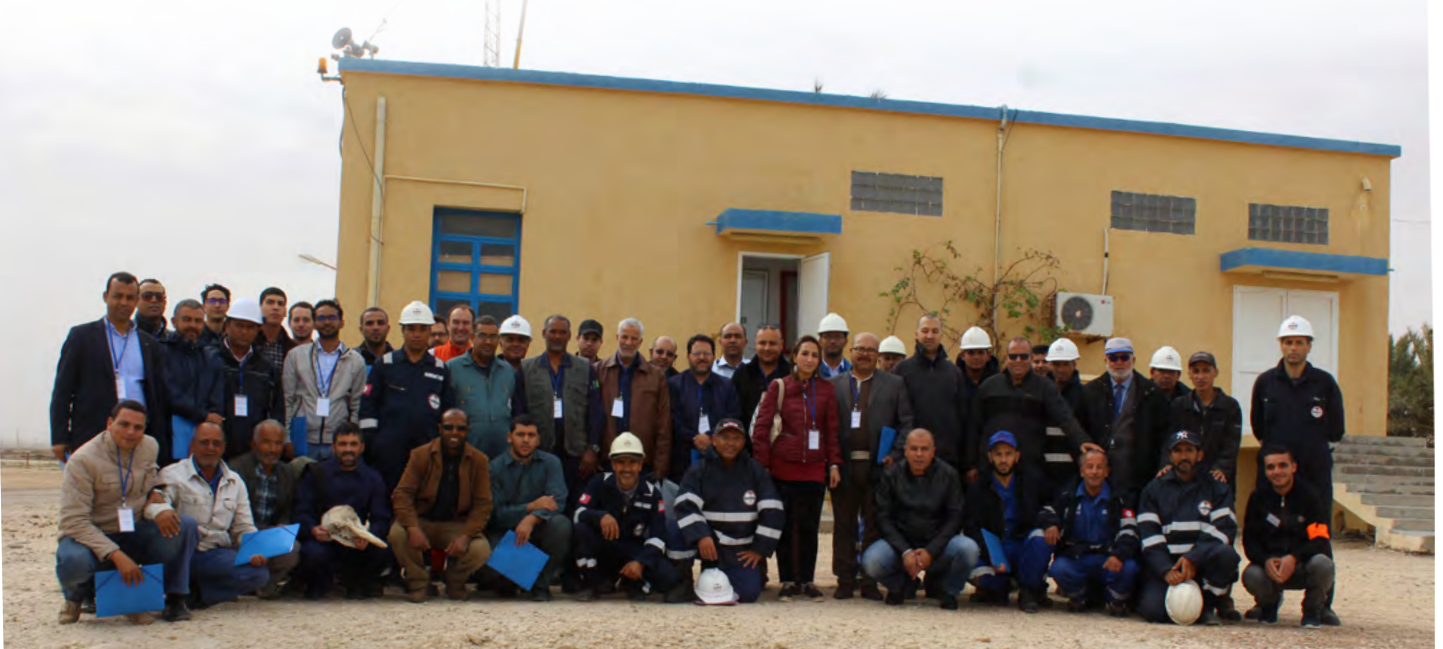
Group Photo of Exercise Participants

The exercise consisted of simple demonstration of ECUMED Oil Spill Responses equipments such as fence and offshore booms, skimmers, inflatable tank, Power pack and other accessories. The practical Exercise was carried out in MARETAP terminal and comprised Oiled Shoreline assessment, Cleanup and Oil Spill waste management. The exercise was a great success and gathered more than 30 delegates from MOIG members, guests, MARETAP and ECUMED to observe in real time the first hands the action packed oiled shoreline cleanup exercise.