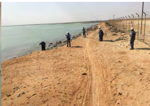
Check of Exercise Area