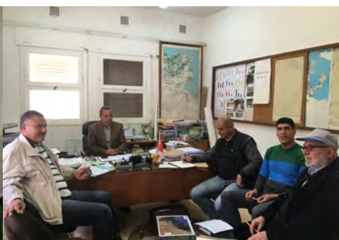
Meeting of 22 November 2016