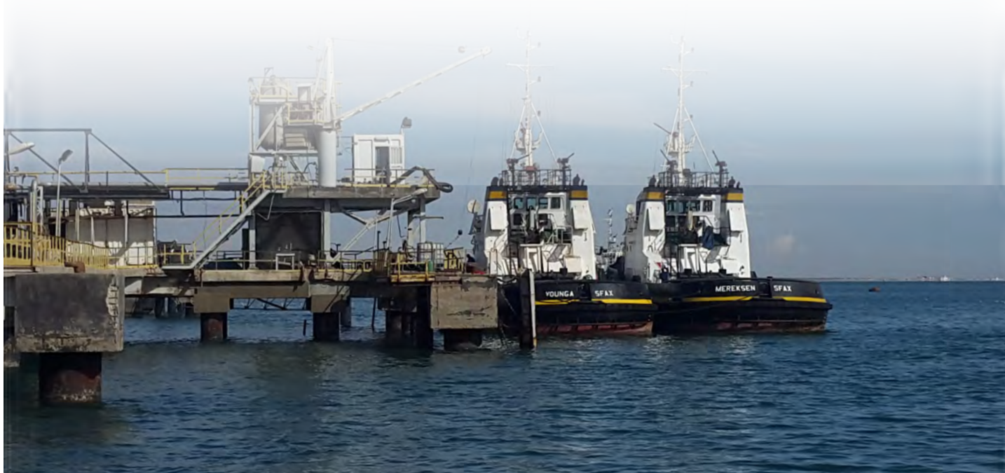
TRAPSA Tugs Mereksen and Younga

A Tier 1 Oil Spill Response Exercise shall be held on the second half of October 2017 in Skhira Port located in the Gulf of Gabes in the coast of the Mediterranean Sea in Tunisia. The event will be organized jointly by the Company "Transport par Pipeline au Sahara" (TRAPSA); member; and the Mediterranean Oil Industry Group (MOIG). SKhira is the most important industrial port in Tunisia specialized in petroleum and chemical products traffic. TRAPSA main activities are transport by pipeline, storage and loading of crude oil and its derivatives. The company has a huge Tank Park of 380 000 m 3 capacity. Regarding its reponse capability, TRAPSA has a Tier 1 Oil Spill Response Package supported maritime assets.