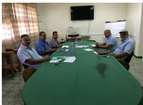
Meeting of 26 October 2016

The company is enhancing its strategy of preparedness in case of oil spill incidents through this exercise. The event will spread over 02 days, the first day will be dedicated to theoretical part-Workshop and held in one hotel in Sfax City and the second day for practical part in TRAPSA Terminal. A series of meetings were performed in TRAPSA Headquarter in Tunis and Skhira port between TRAPSA representatives and MOIG Management Committee Members to exchange the first ideas and views about the technical and logistical arrangements of the exercise.