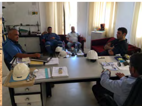
ECUMED Base Meeting

We are very pleased with the overall results of these meetings, both MARATEP and ECUMED representatives expressed their commitment to mobilize human and material resources to ensure the success of this event.