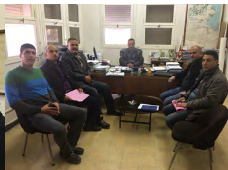
Meeting of 21 December 2016

We are very delighted with the outcome of these meetings, General Management and Technical Direction of TRAPSA and MOIG expressed a range of views regarding the event programme and agreed to create a Steering Committee to develop, manage, execute and identify lessons learned of the exercise as well as to mobilize required resources and means to ensure the success of this event. More detailed information on this exercise will be provided in the next few months.