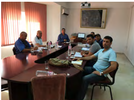
MARETAP CPF Meeting

October 27, within the framework of POSOW 2 project, the MOIG Director performed preparatory meetings with MARETAP and ECUMED teams in Zarzis to discuss the technical and logistical arrangements for practical exercise titled "Oiled Shoreline Survey and Cleanup" to be performed on 24 November 2016 by Cedre, REMPEC, ISPRA and FEPORTS for representatives of Libyan Oil and Gas Industry. In addition, visits were carried out to MARETAP Terminal and ECUMED Base to check the area and Cleanup and Oil Spill Response equipments that will be used during the practical exercise day.