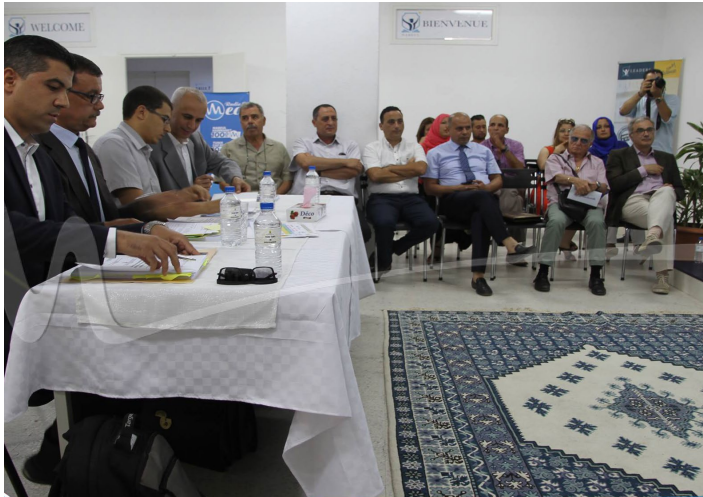
Jury Members and Observers