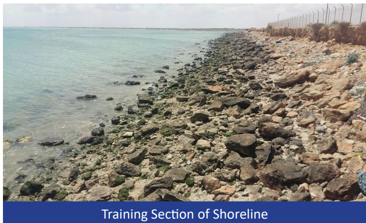
Training Section of Shoreline

The event will be organized jointly by Cedre, REMPEC, ISPRA, DG-MARINWA, FEPORTS, AASTMT, MOIG, MARETAP and ECUMED Petroleum and will open on Thursday, 24th November 2016 at 08:15 hours and expected to close on the same day at 12:00 hours.